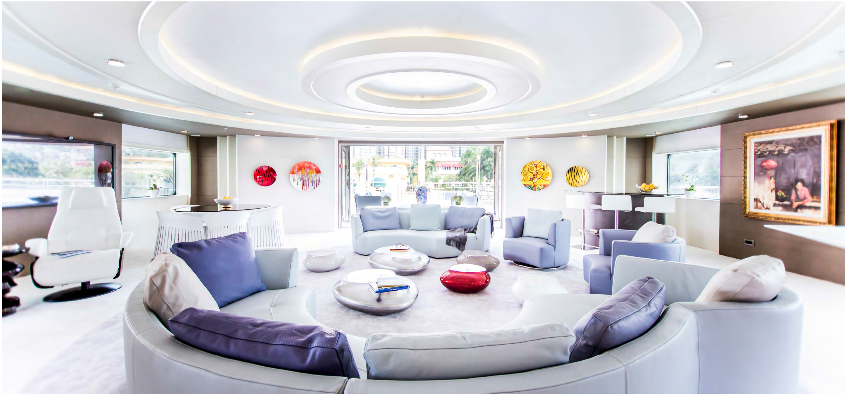
Bridge Deck Salon 船桥甲板