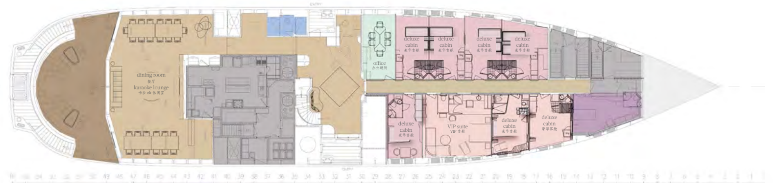
459 sqm 米 Main Deck 主甲板