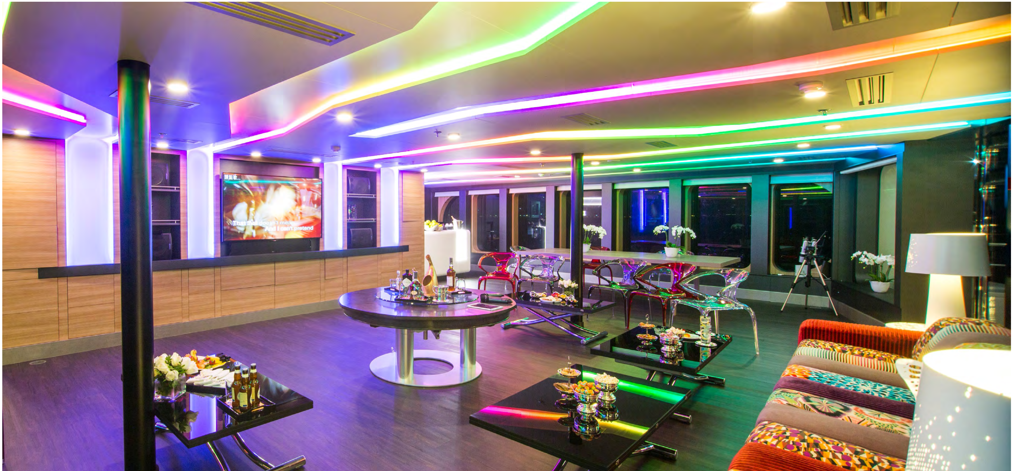
Main Deck Salon 主甲板