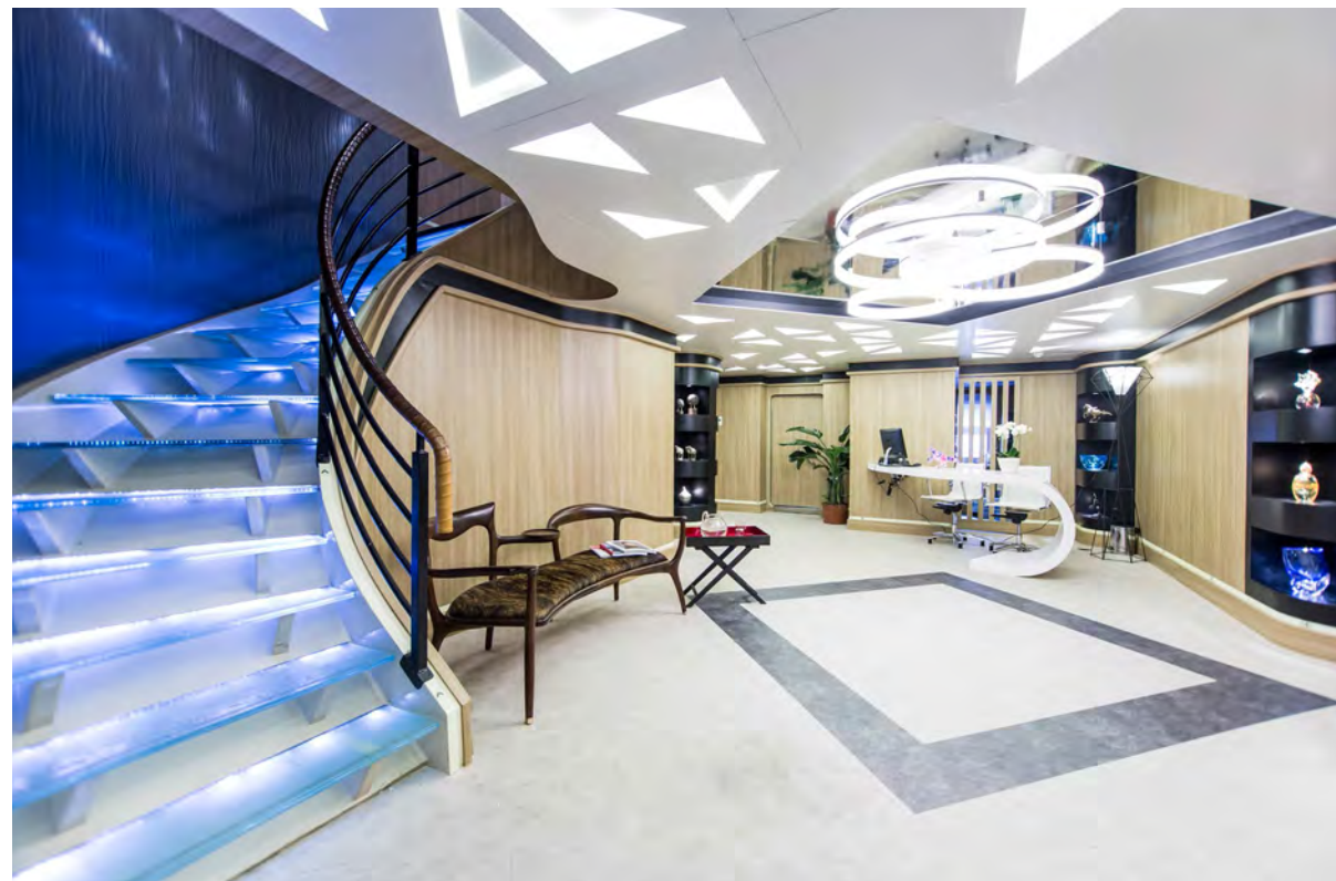
Above: Foyer 上面: 前厅 Left: Deluxe Cabin 左边: 间豪华客舱