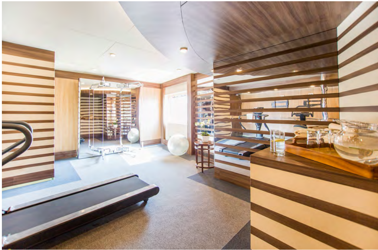
Above : Gym 上面: 健身中心 Right : Spa 右边: 水疗 spa