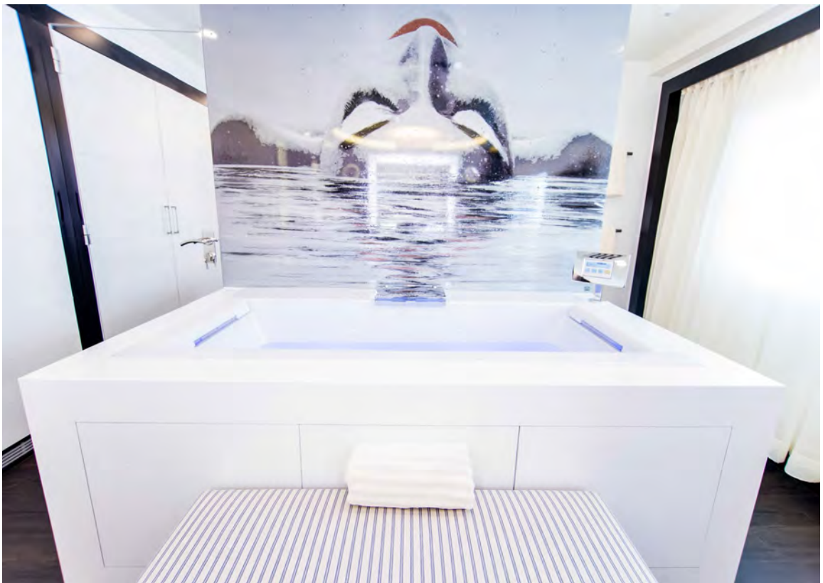
Master Suites 两间主客舱