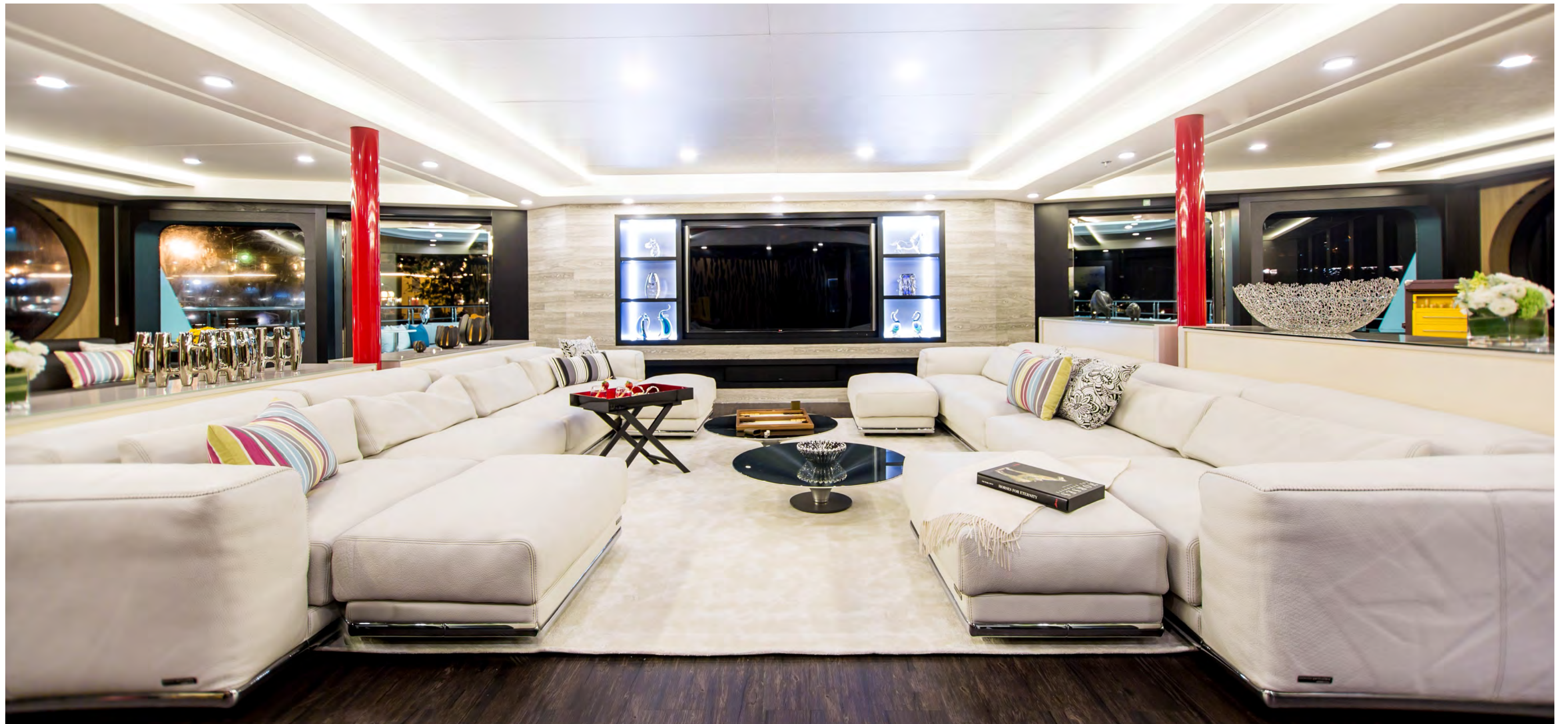
Upper Deck Salon 上层甲板