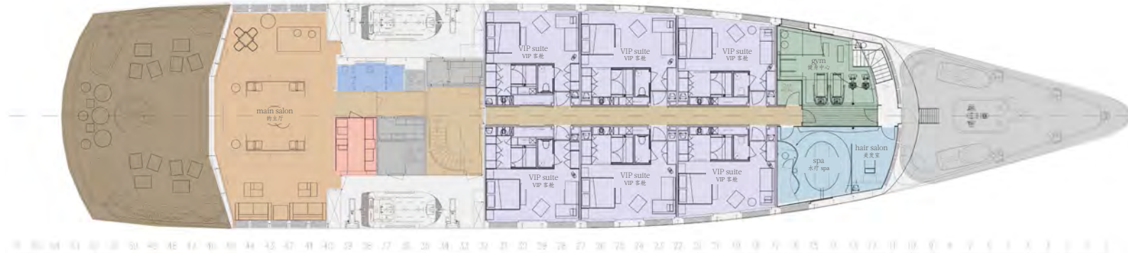
561 sqm 米 Upper Deck 上层甲板