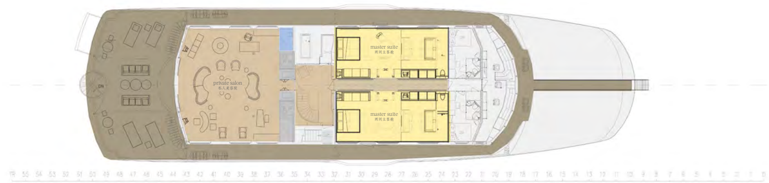
310 sqm 米 Bridge Deck 船桥甲板