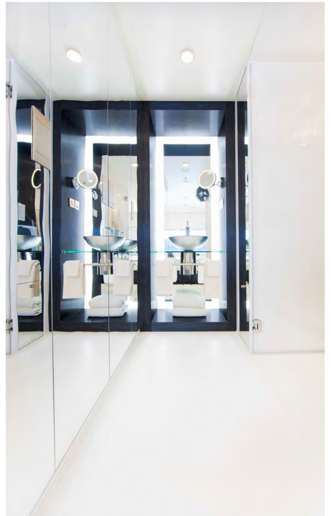
VIP Cabins VIP 客舱